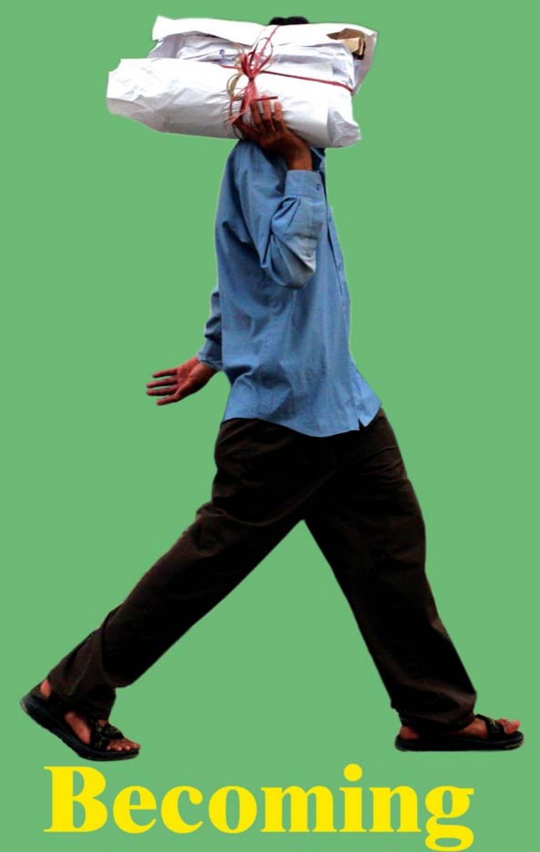
Becoming a Journalist in Exile